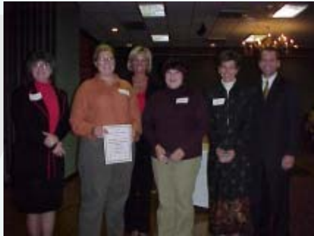
Representatives of East Side West Side After School Reading Club