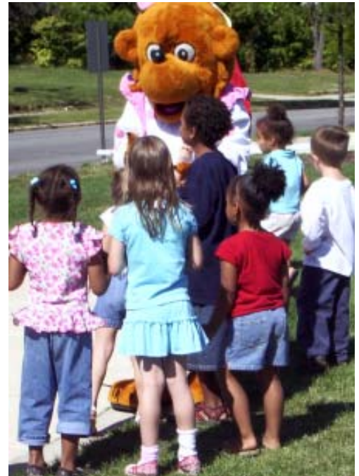
Children greet the Berenstain Bears' Sister Bear at this year's Rally to Read on September 27. The annual event promotes literacy and draws hundreds who receive free books and free lunch. Participants were entertained by stories, activities, and performances. At the end of the event, names were drawn for four reading rooms. Each room was for a particular age group, child, youth, teen, adult, and all contained chair, lamp, rug, bookcase with books, computer, and computer desk. More than twenty local organizations collaborate to make the Rally to Read a success.