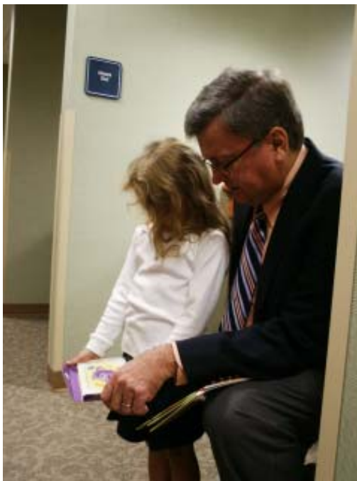
Representative Mark Souder shares a book at Family Practice Residency Center on October 10. A longstanding supporter of Reach Out and Read, Representative Souder was reviewing the program at the Family Practice site. Reach Out and Read promotes early literacy through pediatric clinics. Family Practice is one of five pediatric clinics in Allen County that provide free children's books and guidance to parents and caregivers when they bring their children in for well-child checkups and immunizations. The Literacy Alliance administers Reach Out and Read through Read to Me.